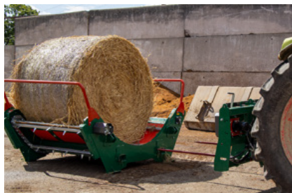
DUALENTRY LOADING SYSTEM - LOAD AND LATCH FROM EITHER SIDE