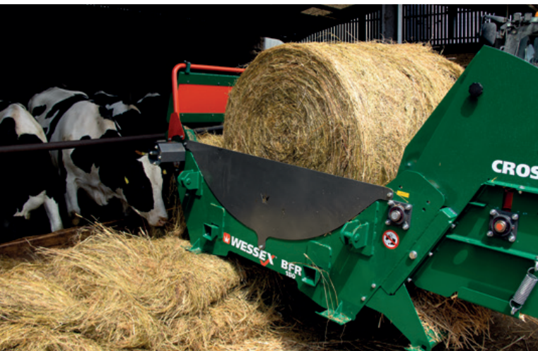
FEED AND BED WITH 1 MACHINE

Straw choppers are renowned for creating excessive dust, which can seriously threaten the livestock's health in an enclosed environment. Chopping bedding straw also reduces its effective life span within the bedding area.